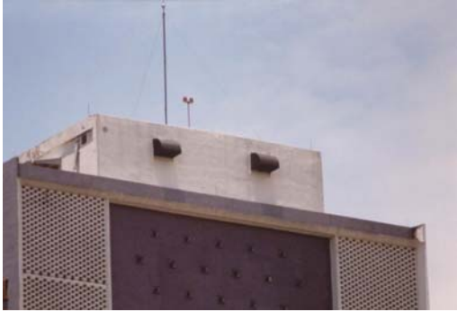
Figure 3: A photograph of the Wisma Tanah building taken in 2000. The building was installed with a French made ESE air terminal.