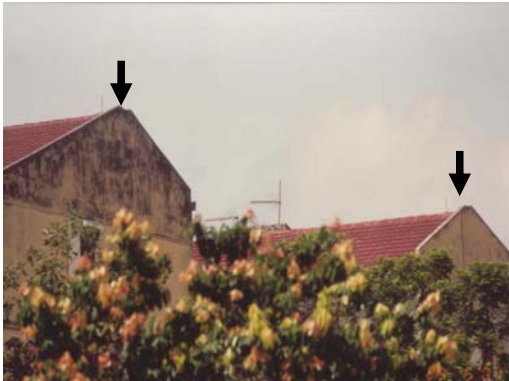
Figure 11: Photograph of two adjacent blocks of apartment showing similar stricken points. In both cases, the Franklin rods were installed just 0.5m away from the ends.