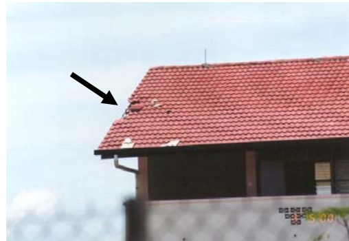
Figure 10: Photograph of a stricken point on the slanting edge of the gable roof. The air terminal conductor should also be installed on the edges of the gable roof.