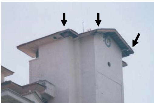
Figure 5: A photograph of one of the Setapak Ria apartment building showing the French made ESE air terminal and the stricken points.

These buildings had been installed with the French made ESE air terminals when they were photographed in 1997. The buildings consist of multi-tiered roofs and the air terminals were centrally located on the highest roof per apartment building.