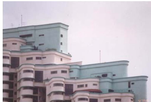
Figure 7: Photograph of the Villa Putri apartment showing the two Australian made ESE air terminals installed on the split-level roofs.