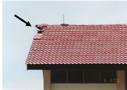
Figure 9: Photograph of a stricken point at the gable roof ridge end. The Franklin rod should have been installed right on top of the ridge end instead of about 1m away from it.

the Franklin rods to intercept the lightning stroke has more to do with erroneous positions of the rods rather than the rods themselves.