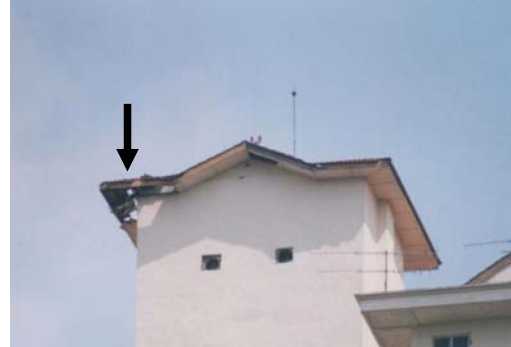
Figure 6: A photograph of the other Setapak Ria apartment building showing a different French made ESE air terminal and the stricken point.