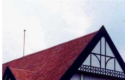
Figure 1: A photograph of the RSC building taken in 1998. The building was installed with an Australian made ESE air terminal

struck and damaged the façade which was about 20m away (Figure 2).