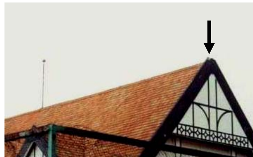
Figure 2: A photograph of the RSC building taken in 2001. The building had been struck and damaged by lightning as can be seen on the right.