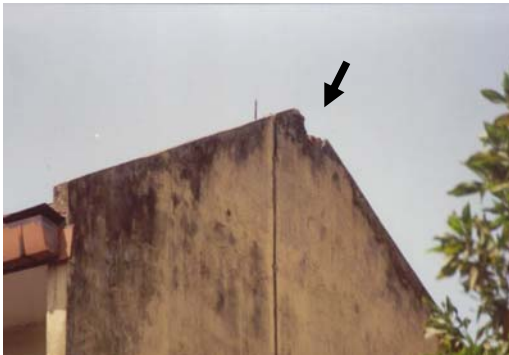
Figure 12: A close-up photograph of another apartment block showing the stricken point and the Franklin rod beside it. For effective protection, the rod must be positioned right on the ridge ends and similar high risk locations.